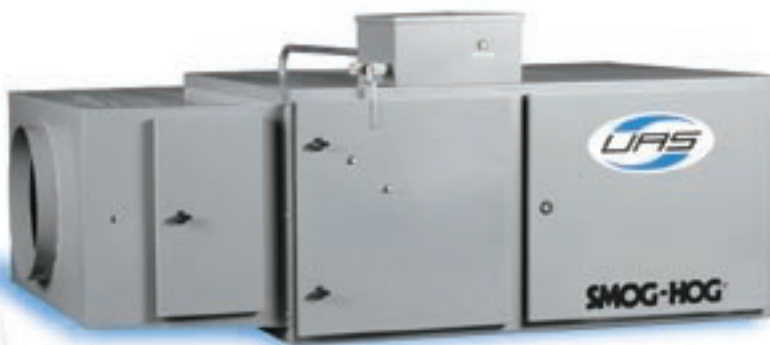
SHN-20 with optional inlet plenum

SHN/SG units are equipped with airflow capacities ranging from 400 to 9,000 CFM. Systems can be ducted, unducted, free hanging and machine-mounted, depending on your specific application—eliminating the need to give up valuable floor space in your facility!