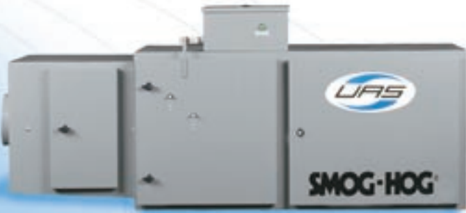
SHN-10 with optional inlet plenum