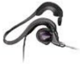
DuoPro H181, behind-the-head model with voice tube