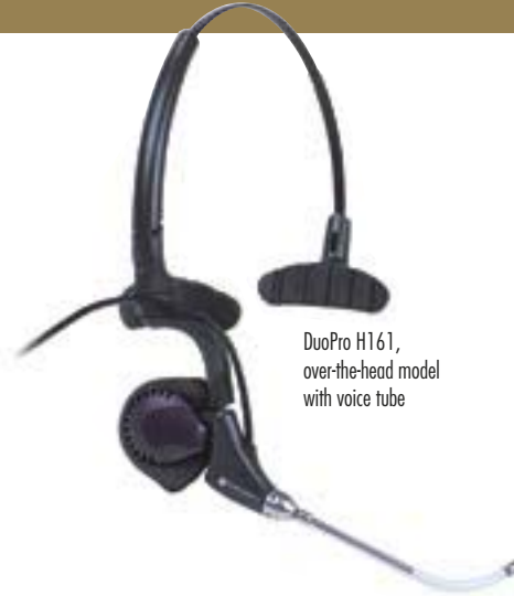
DuoPro H161, over-the-head model with voice tube