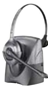
CS351N Monaural with Noise-Canceling microphone