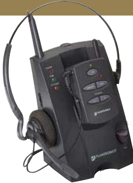
CS10 Cordless System features a DuoSet convertible headset (shown here in over-the-head configuration)