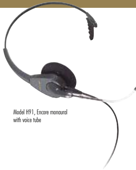
Model H91, Encore monaural with voice tube