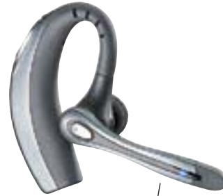
Microphone boom pivots for perfect positioning on either ear