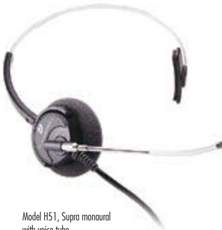
Model H51, Supra monaural with voice tube