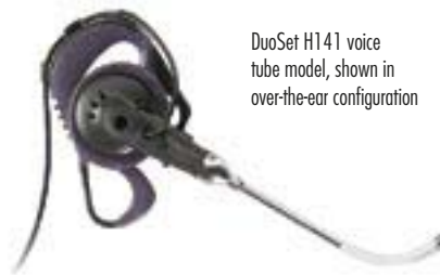
DuoSet H141 voice tube model, shown in over-the-ear configuration