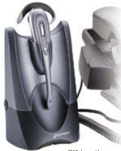
CS50 shown with HL10 Handset Lifter