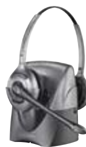
CS361N Binaural with Noise-Canceling microphone