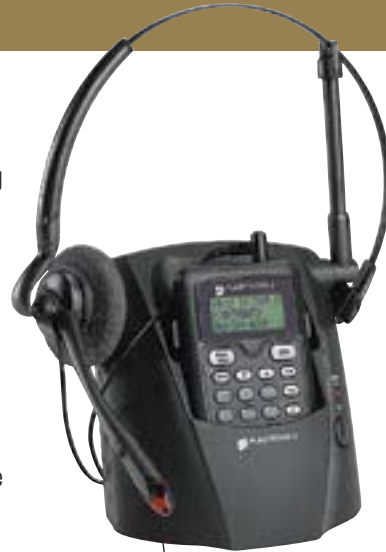
The Firefly® in-use indicator light lets others know when you're on the phone