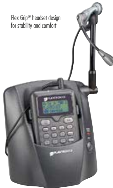
Flex Grip® headset design for stability and comfort