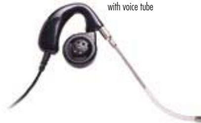
Model H41, Mirage with voice tube