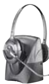
CS361 Binaural with Voice Tube