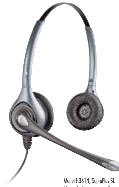
Model H361N, SupraPlus SL binaural with noise-canceling microphone