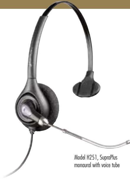
Model H251, SupraPlus monaural with voice tube

All Plantronics H Series headsets include this convenient Quick Disconnect™ feature that lets you walk away from your phone without removing your headset.