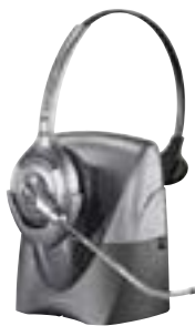
CS351 Monaural with Voice Tube

The SupraPlus Wireless Professional Headset System is available in four models: