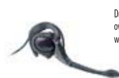
DuoPro H151N, over-the-ear model with noise canceling