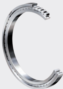
NKE full complement cylindrical roller bearing (without cage)