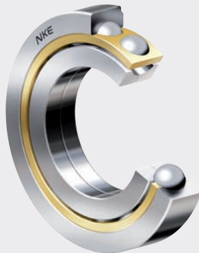
NKE four-point contact ball bearings