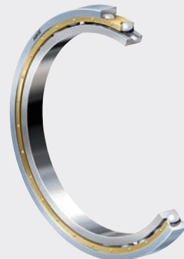
NKE deep groove ball bearings (with insulation coating on outer ring)