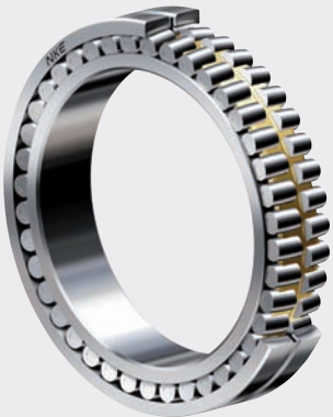
NKE spherical roller bearing