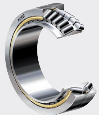
NKE tapered roller bearing